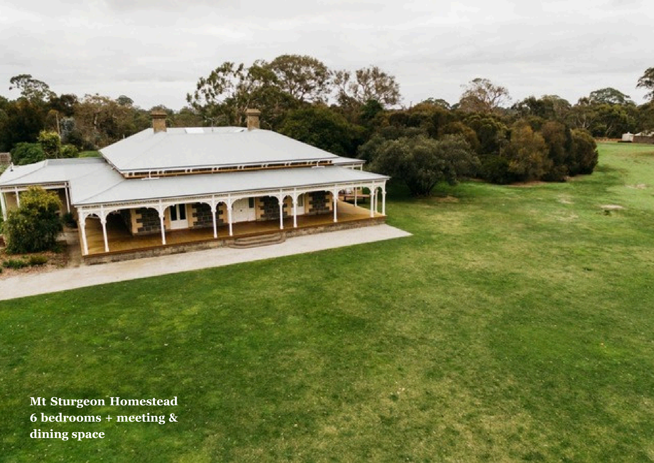
Mt Sturgeon Homestead 6 bedrooms + meeting & dining space