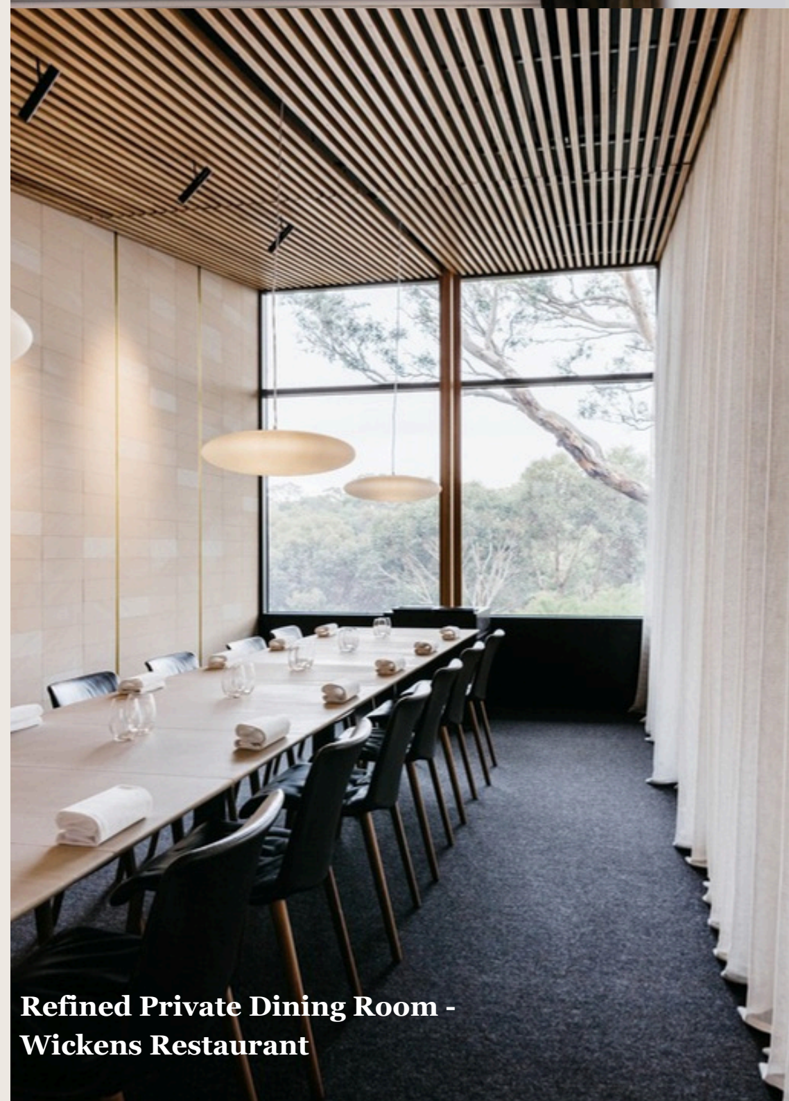
Refined Private Dining Room - Wickens Restaurant

Your team can be inspired during a visit to Australia's largest restaurant kitchen garden, where a chef led tour will inspire.